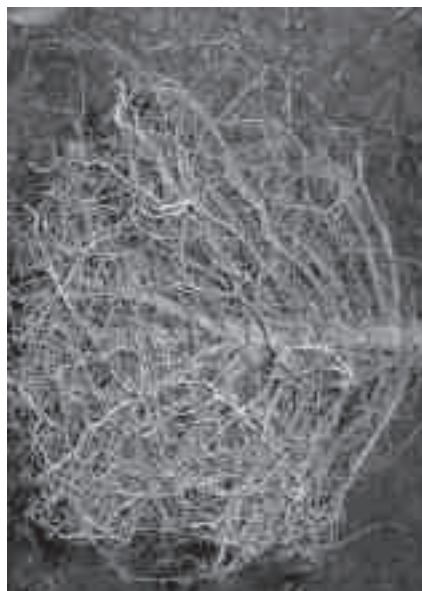
◀ Figure 3. Quality root ball grown in three-gallon container without root pruning.

Roots pruned several times in the nursery grow denser with smaller diameter roots and fewer large roots (figure 4). This has been shown to increase digging survival and improve landscape performance 2 .