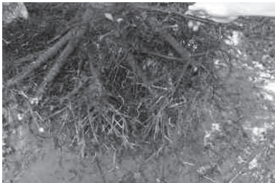
▼ Figure 4. Quality field-grown root ball resulting from multiple root prunings.

Nurseries that routinely move trees from one field to another during production automatically prune roots. Quality nurseries that produce certain trees without moving them implement root pruning in place.