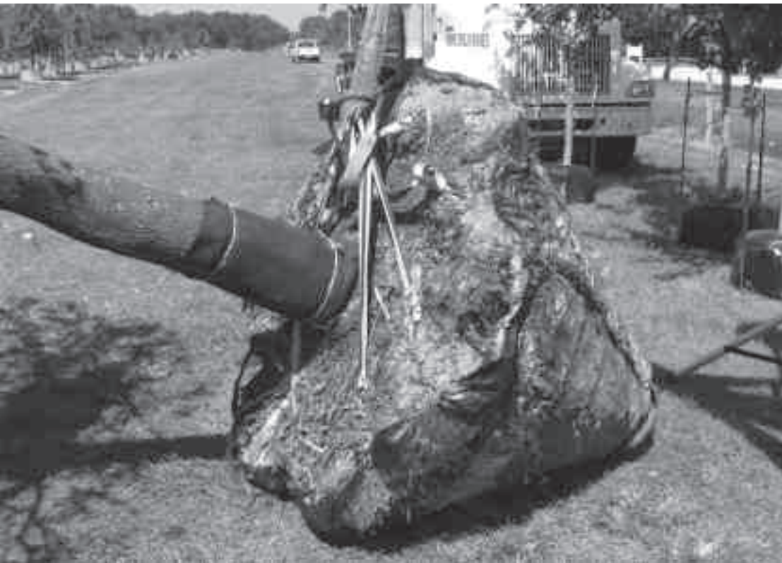
◀ Proper tree handling shown here lifts the weight of the tree by the basket and protects the tree trunk from compression or scraping.